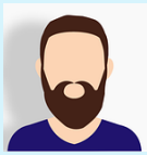
President or Chairperson